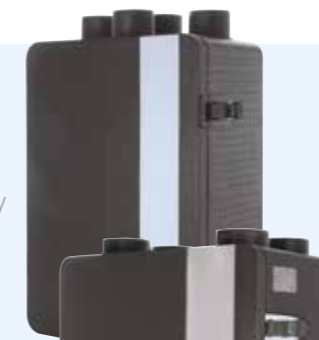
Vort HR 250 Neti

Centralised Heat Recovery range Vort Neti and Vort Avel recover the heat which would have otherwise been lost in the property