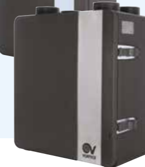
Vort HR 350 Avel