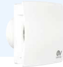
Punto Evo Flexo