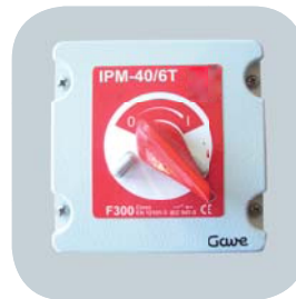
Electrical Isolator fitted to fan for security