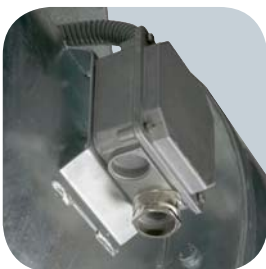
External terminal box for ease of connection