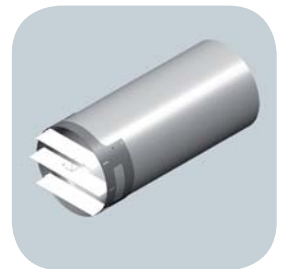
Deflector to direct air. Can be mounted at the inlet or outlet side